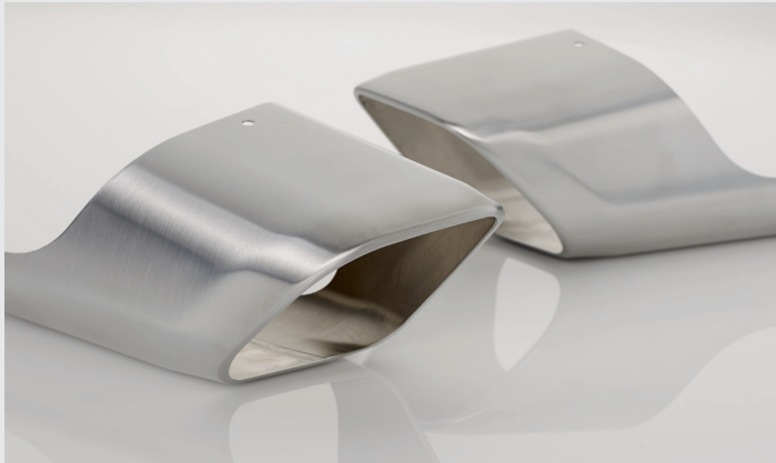
Aluminum components with transparent glass coating: anti-fingerprint, heat resistant, no corrosion